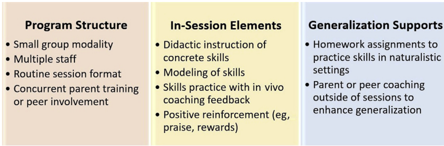
Fig. 1. Common programmatic elements in evidence-based social skills training interventions for ASD.

content, respectively, in social skills training for ASD populations. Importantly, these figures are not representative of every possible effective intervention technique or helpful content area, but instead, document the methods and content that have generally been used in programs that produce clinically significant social gains. Many of the extracted commonalities are similar to previous summaries of components in evidence-based social skills training, 74,75 providing additional support for their validity. However, because the field is continuing to expand rapidly, updated reviews and syntheses will be needed in the coming years.